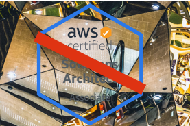
DO NOT put the badge over busy imagery.