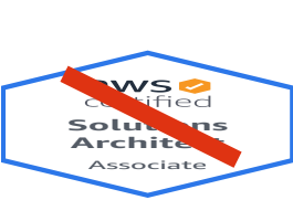
DO NOT distort the badge.