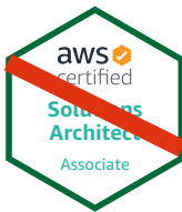
DO NOT alter the colors.