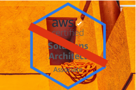
DO NOT put the badge on a background with low contrast.