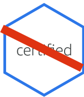
DO NOT alter the badge.