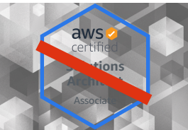
DO NOT place on a patterned background.