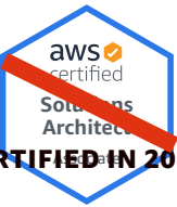
DO NOT overlay graphics or text.